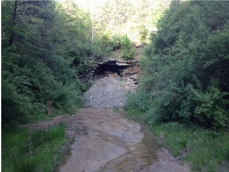
View of South Portal