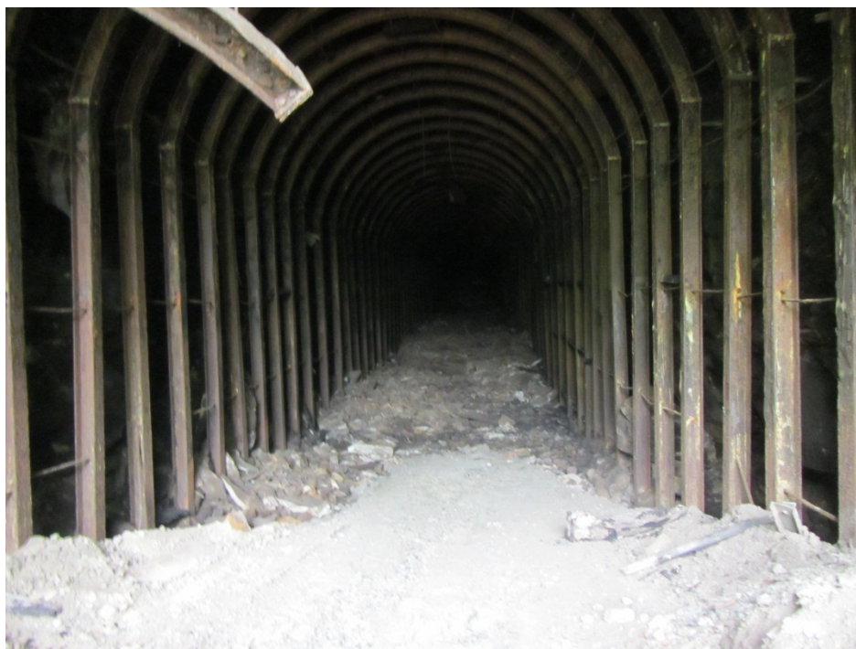
View inside North Portal