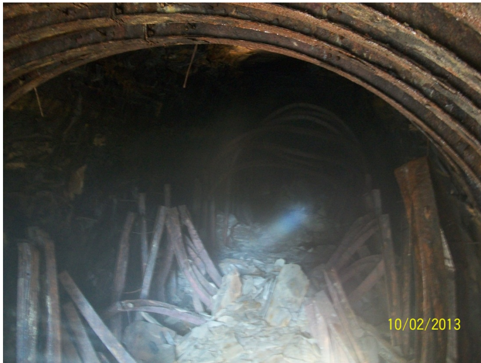
View just inside South Portal