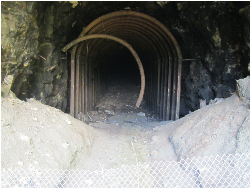
View at North Portal