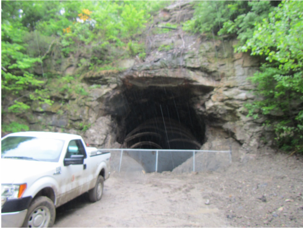
View of North Portal